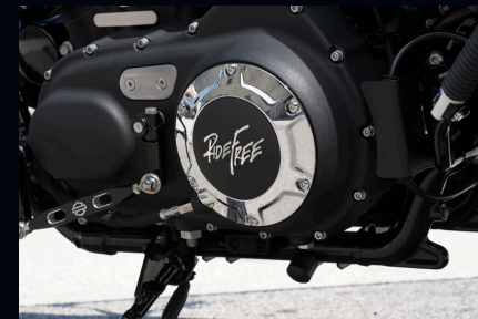
Ride Free™ Collection Derby Cover