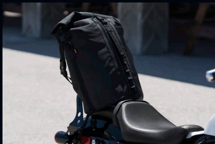
Overwatch Dry Bag

For the moto-obsessed, this Forty-Eight® model focuses on the essentials that make choppers great. With chiseled handlebars, sissy bar, and 80GRIT™ footpegs, it's ready to take the long road and look good doing it.