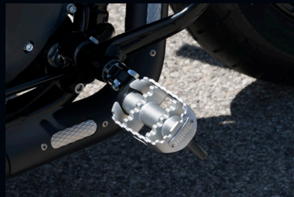
80GRIT™ Rider Footpeg w/ Wear Peg