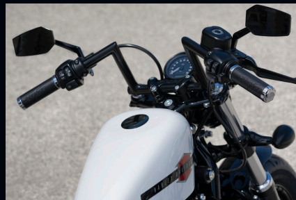
Chiseled Lo Handlebar