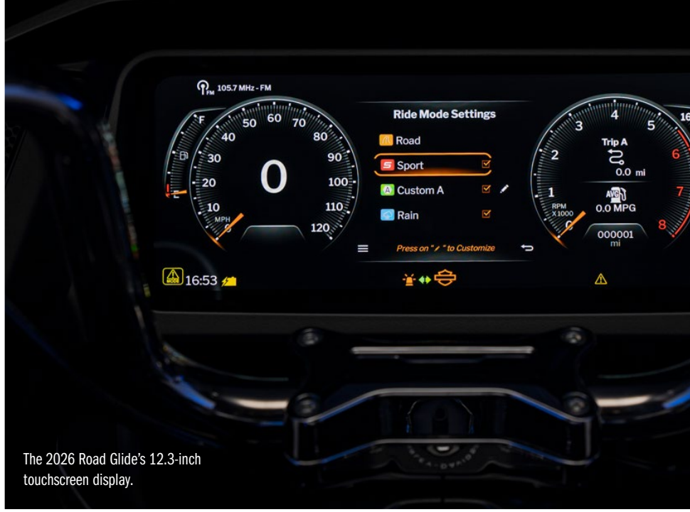
The 2026 Road Glide's 12.3-inch touchscreen display.

The large, 12.3-inch touchscreen display provides bright, easy-to-read information at a glance, including current ride and light modes. The 2026 Road Glide® also features the Skyline™ OS-connected infotainment system, built-in GPS, Apple CarPlay and a USB port for mobile charging. Software updates can be completed wherever Wi-Fi is available.