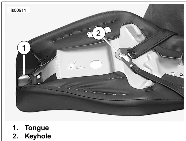
Figure 2. Underside of 2-up seat