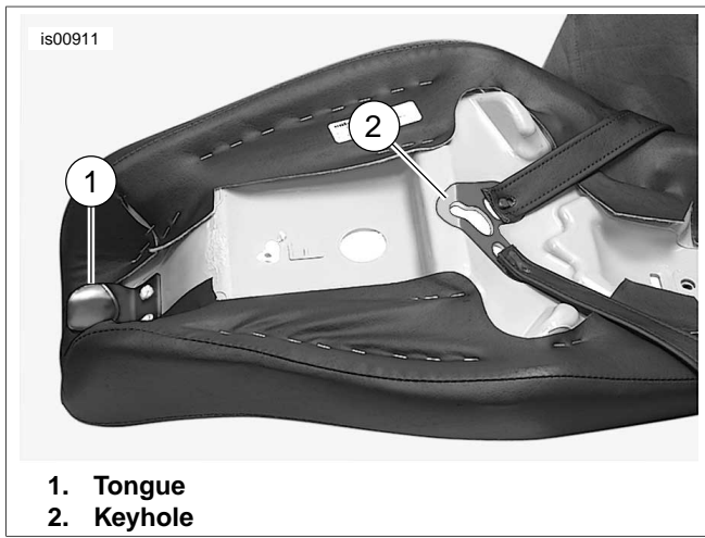
Figure 2. Underside of 2-up seat